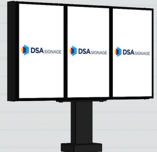
Triple Menu Board