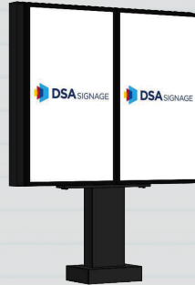
Double Menu Board