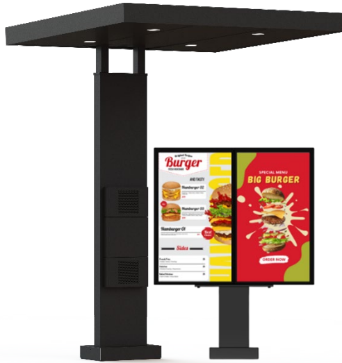
Order Point Canopy with speaker & mic housing + Menu Board