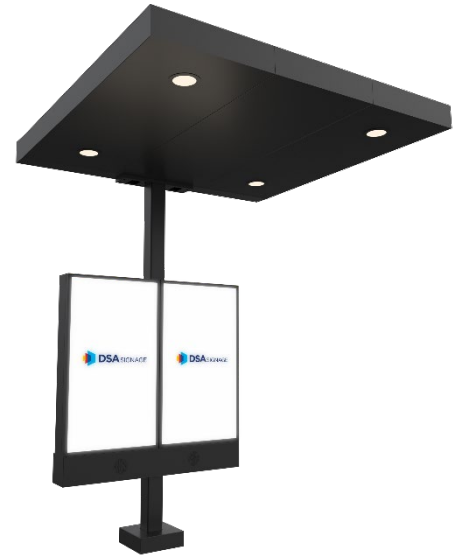
All-in-One Order Point Canopy includes speaker & mic housing and a double digital menu board