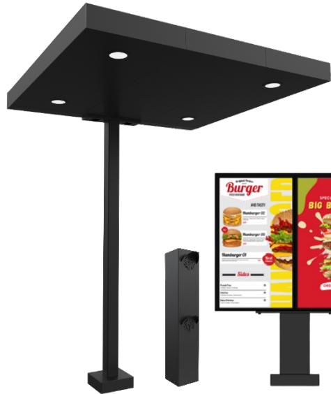
Standalone Canopy + Speaker Post + Menu Board

Our options to create a unique Order Point with Canopy: