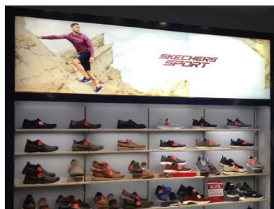
Skechers (Calgary, Canada)

Need a different size? Contact us for a custom quote to fit your exact dimensions and specs.