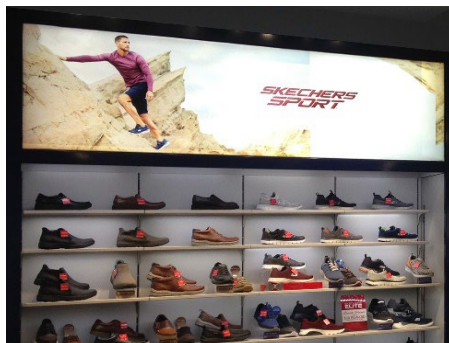
Skechers (Calgary, Canada)