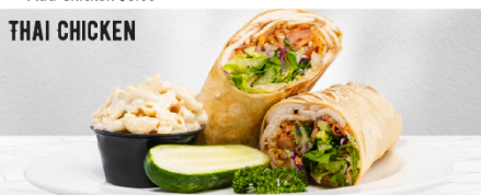
*Restaurant Menu Example