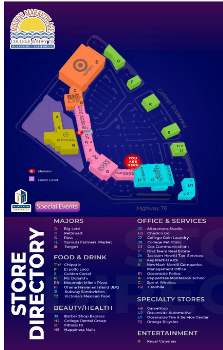
*Retail Directory Example