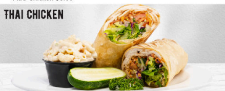
*Restaurant Menu Example