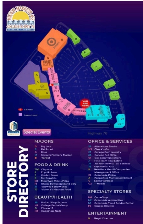
*Retail Directory Example