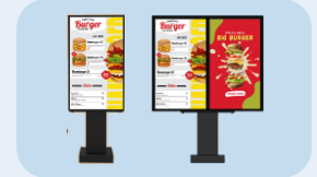
Outdoor Menu Board