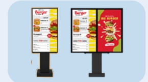
Outdoor Menu Board