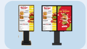
Outdoor Menu Board